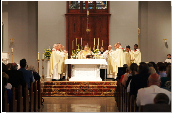
For great is the LORD and greatly to be praised!