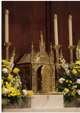
You are my God, and I give thanks to You!