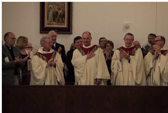
You are my God, and I give thanks to You!